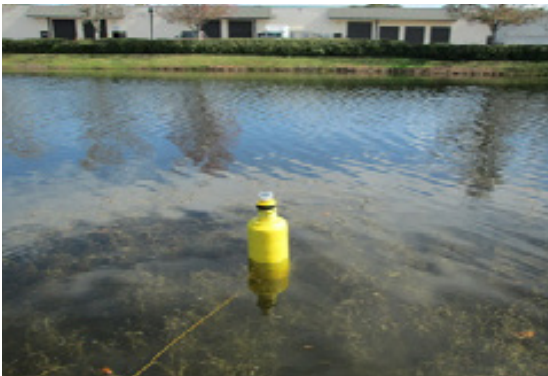
"EMM25 Buoy deployed in retention pond measuring DO" *Shown with optional beacon*